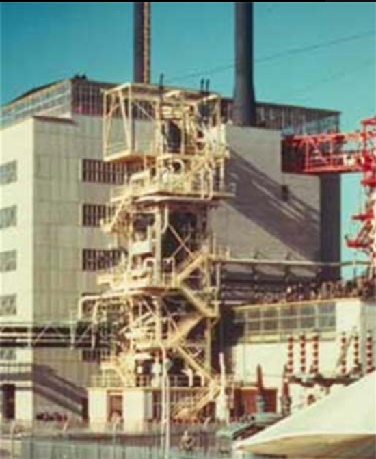
External view of Calder Hall Magnox Reactor (# 2) at Sellafield, UK (265MWth / 50 Mwe)