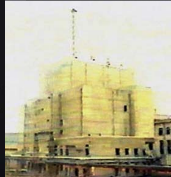
External view of Yongbyon Magnox Reactor, DPRK (25 MWth / 5 Mwe)